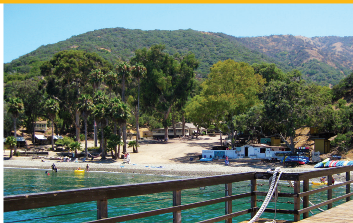
InterVarsity's Campus by the Sea Catalina Island, CA